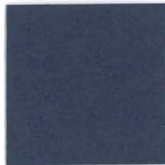
57150 EPIC TOP SCORE PURPLE