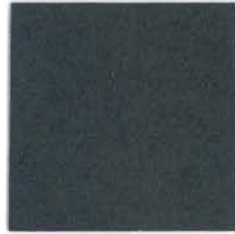
66500 EPIC TOP SCORE NAVY