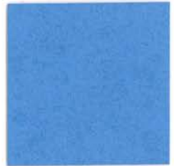
60500 EPIC TOP SCORE COLUMBIA BLUE