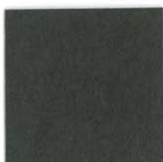
20100 EPIC TOP SCORE DARK BROWN