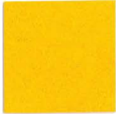
80000 EPIC TOP SCORE GOLD

Printer-friendly solutions for Athletic Printing on Automatic and Manual Textile Presses