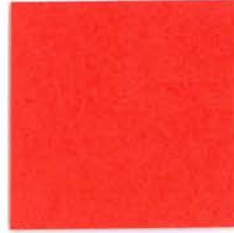
30200 EPIC TOP SCORE BRIGHT ORANGE