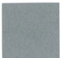
14600 EPIC TOP SCORE DARK GRAY