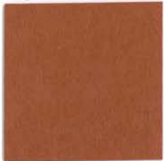
30600 EPIC TOP SCORE TEXAS ORANGE