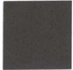
44500 EPIC TOP SCORE LIGHT MAROON