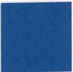
62100 EPIC TOP SCORE ROYAL BLUE