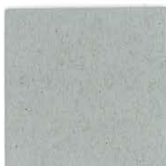
15350 EPIC TOP SCORE SILVER GRAY