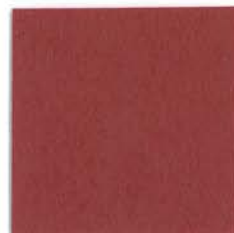
41850 EPIC TOP SCORE CRIMSON