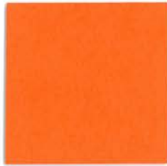
30150 EPIC TOP SCORE LIGHT ORANGE